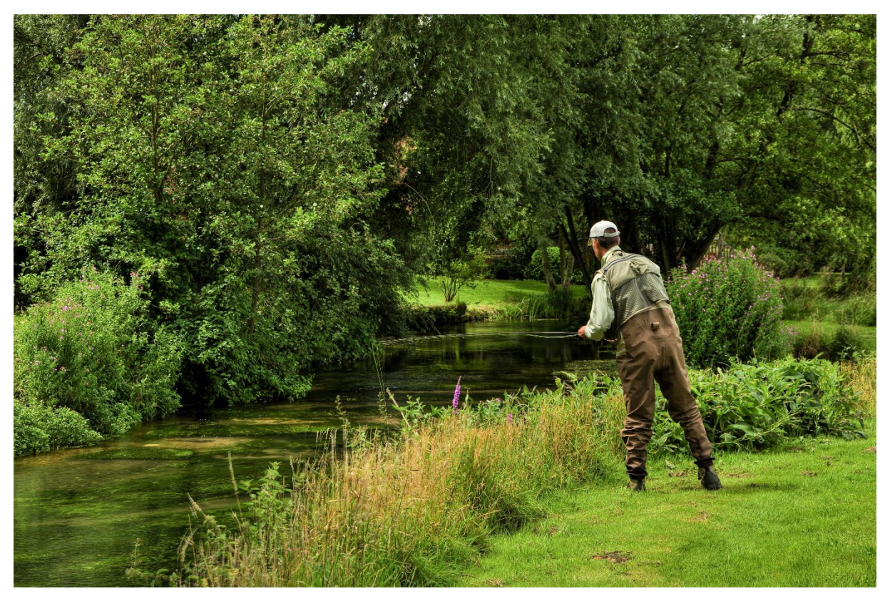
A few yards up from start of the beat

Downstream of the wooden footbridge: Cross the footbridge to the opposite bank; the end of the beat is a concrete bridge with a steel handrail which is about 150 yards downstream. The best way to reach the start is on foot; cross the wooden footbridge in the garden, turn right downstream until you reach the concrete bridge.